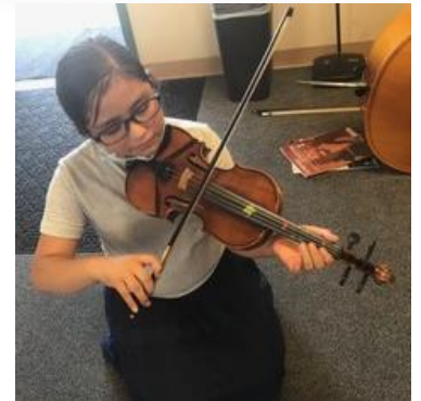
Fortissimo Students Happy to Be Back Together Please see the "You are Amazing" Project and click on the video